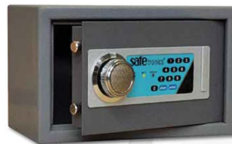
HTL 20 LE

The HTL 20 LE is a single-jacket hotel safe designed for storing articles of value (documents, mobile phones, keys, cash ...). The jacket is made of 2 mm thick quality steel sheet. The door plate is of 3 mm steel sheet. The safe can be anchored through two openings in the safe bottom.